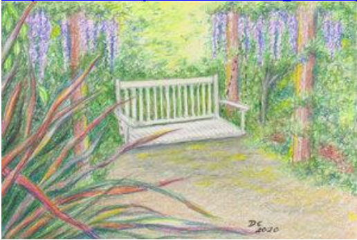
Garden Swing by Doreen Cohen

https://www.pacificartleague.org/wish-you-were-here-postcard-show