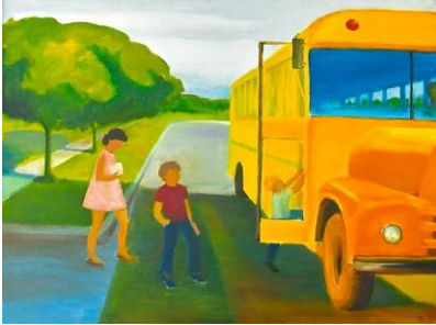
First Day of School, acrylic,