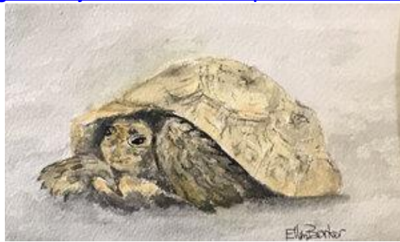
Shell-tering In Place by Ellen Barker

The show will move to the gallery as soon as it is allowed to reopen. PAL is still accepting submissions if you want to get in on the fun.